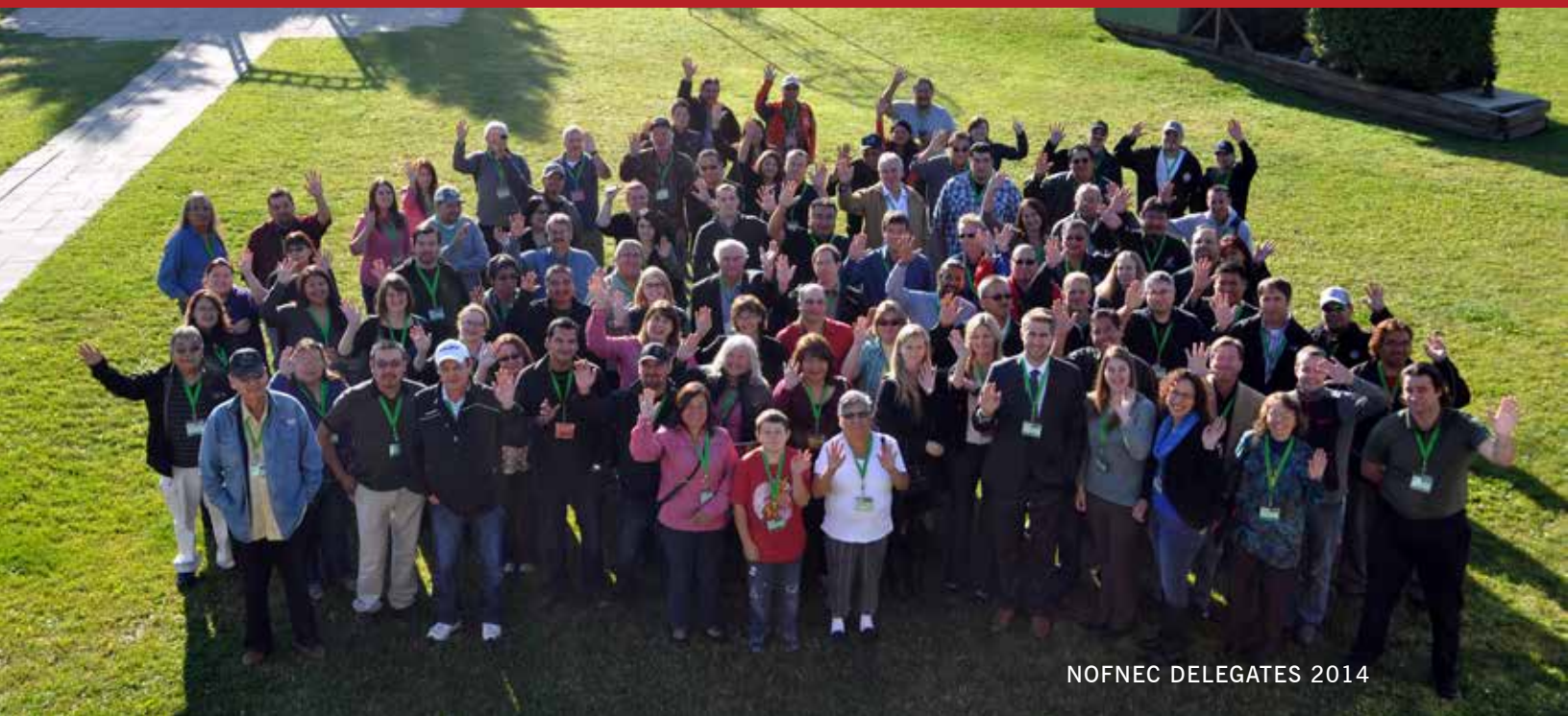
NOFNec DELEGATES 2014